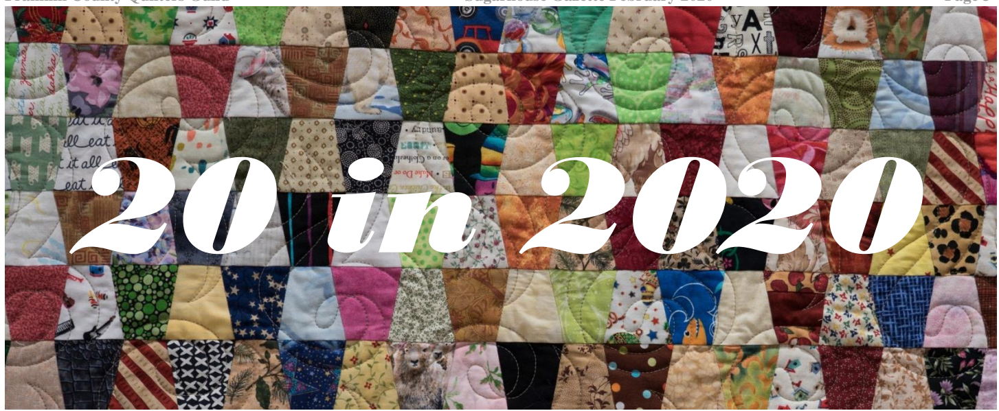
That is 20 Finishes in 2020!

Join in the fun and make 20 quilted projects by the end of 2020 and your name will be entered into a special drawing held in December. If you'd like to participate, fill in your name and 20 projects you'd like to finish this year on the list below. This is your list...you can add to it throughout the year if need be to have 20 projects or you can remove a project, or swap out projects, etc...you just have to have 20 Finishes in 2020 AND you must show each project during one of the guild's monthly show and tell...a picture will NOT suffice! You can show multiple projects in one month. You also don't have to show a carburetor project every month, you just have to have 20 Finishes in 2020! Kris Bachand will collect the lists and check off each project when it is revealed at show and tell.