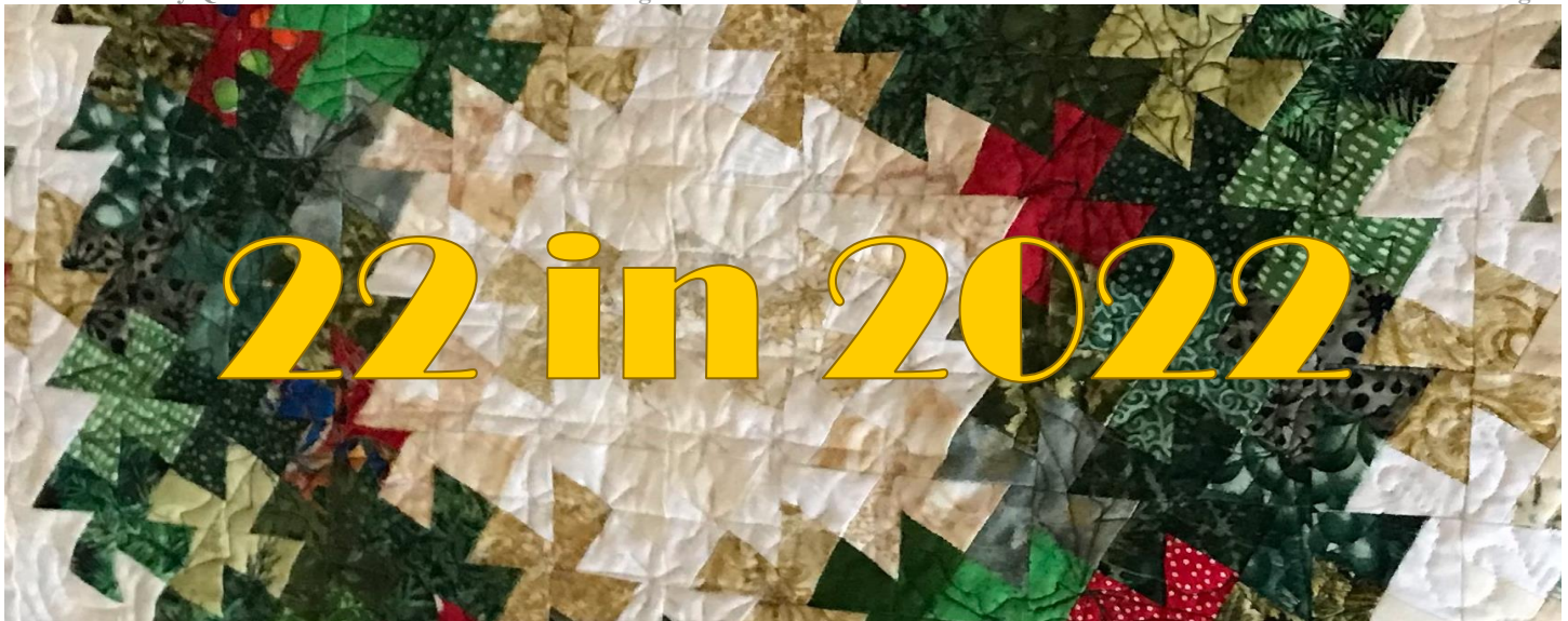
That is 22 Finishes in 2022!

Join in the fun and make 22 quilted projects by the end of 2022 and your name will be entered into a special drawing held in December 2022. If you'd like to participate, fill in your name and 22 projects you'd like to finish this year on the list below. This is your list...you can add to it throughout the year if need be to have 22 projects or you can remove a project, or swap out projects, etc...you just have to have 22 Finishes in 2022 AND you must send a picture of each project for one of the guild's monthly show and tell on Zoom. You can show multiple projects in one month. You also don't have to show a project every month, you just have to have 22 Finishes in 2022! You will maintain your own list, but you must let Sharon Perry know you are participating.