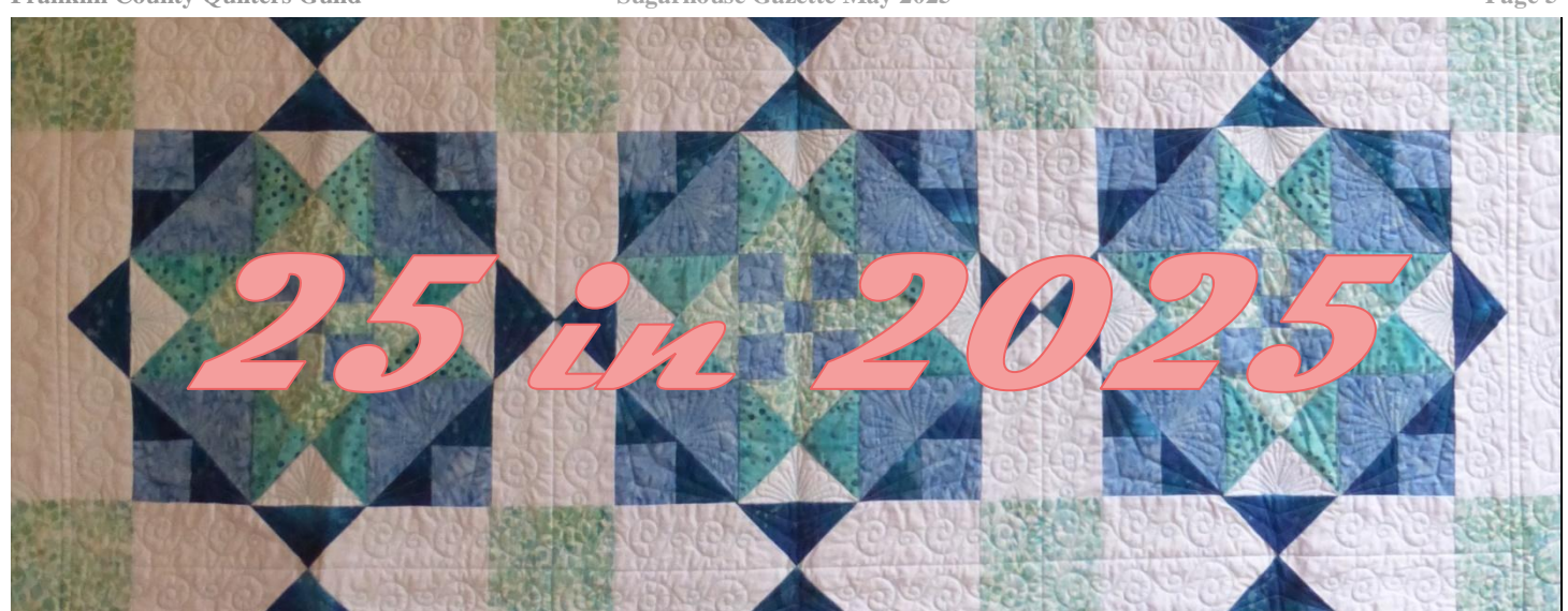
That is 25 Finishes in 2025!

Join in the fun and make 25 quilted projects by the end of 2025 and your name will be entered into a special drawing held in December 2025. If you'd like to participate, fill in your name and 25 projects you'd like to finish this year on the list below. This is your list...you can add to it throughout the year if need be to have 25 projects or you can remove a project, or swap out projects, etc...you just have to have 25 Finishes in 2025 AND you must show each project at one of the guild's monthly show and tell. You can show multiple projects in one month. You also don't have to show a project every month, you just have to have 25 Finishes in 2025! You will maintain your own list, but you must let Sharon Perry know you are participating.